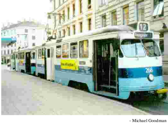
Oslo #12 tram stops at "Lille Frogner Alle." Tram (streetcar) lines form integral part of Norwegian capital's extensive transit network, which includes local trains, subways, buses and ferries serving virtually all of the city's f-million residents. Tickets and passes, good on all transit modes, include single trip, 24-hour pass, seven-day pass and monthly pass. Passengers with passes may board rear car of two-car tram train, while others must board front car to buy ticket from operato On many light rail systems, including most in the United States, tickets are avail e at stations and must be purchased before boarding. Roving inspectors ride the system and passengers found riding without valid tickets or passes are subject to heavy fines.

With such improved passenger amenities-low floor and more comfortable ride—in a less polluting vehicle, why would we qualify our support for hybrid buses on the M-8 or any other route in the city? In a word,