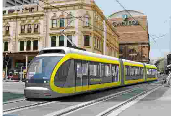
for transit vehicles to ease boarding, cle designed specifically for operation in urban streets. Incentro will go reduce "dwell time" and improve into service on the Nantes, France urban light rail sy em, one of dozens of efficiency. The cover picture on the new systems built or under construction in Europe. Car floor is 11.2 inches above the rail.

dents from outside the metropolitan area the university acquired or constructed a constellation of dormitories and residence halls, many located some distance from the Washington Square campus. Ostensibly under pressure from fearful parents whose teenage youngsters were just getting used to living in a big city, the university established a network of dedicated shuttle buses to "safely" ferry students between the campus and the more distant dorms. Initially the shuttle buses loaded on the south side of Washington Square Park, in front of the Bobst Library. The first group of new shuttle buses were midsized, each painted with the university's symbolic purple stripe. As more routes and buses were added to meet the growing demand, NYU's bus contractor—Gray Line, the tour